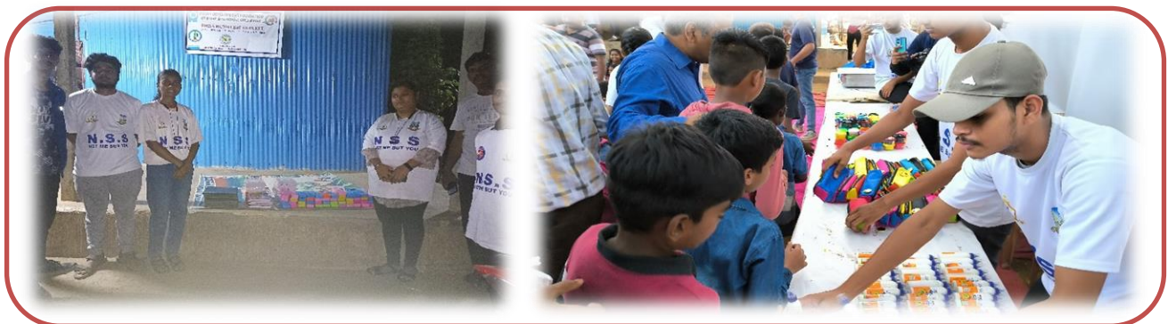
Table of Materials Provided

These materials were carefully selected to support an effective teaching-learning process, ensuring that students have the necessary resources for their education.